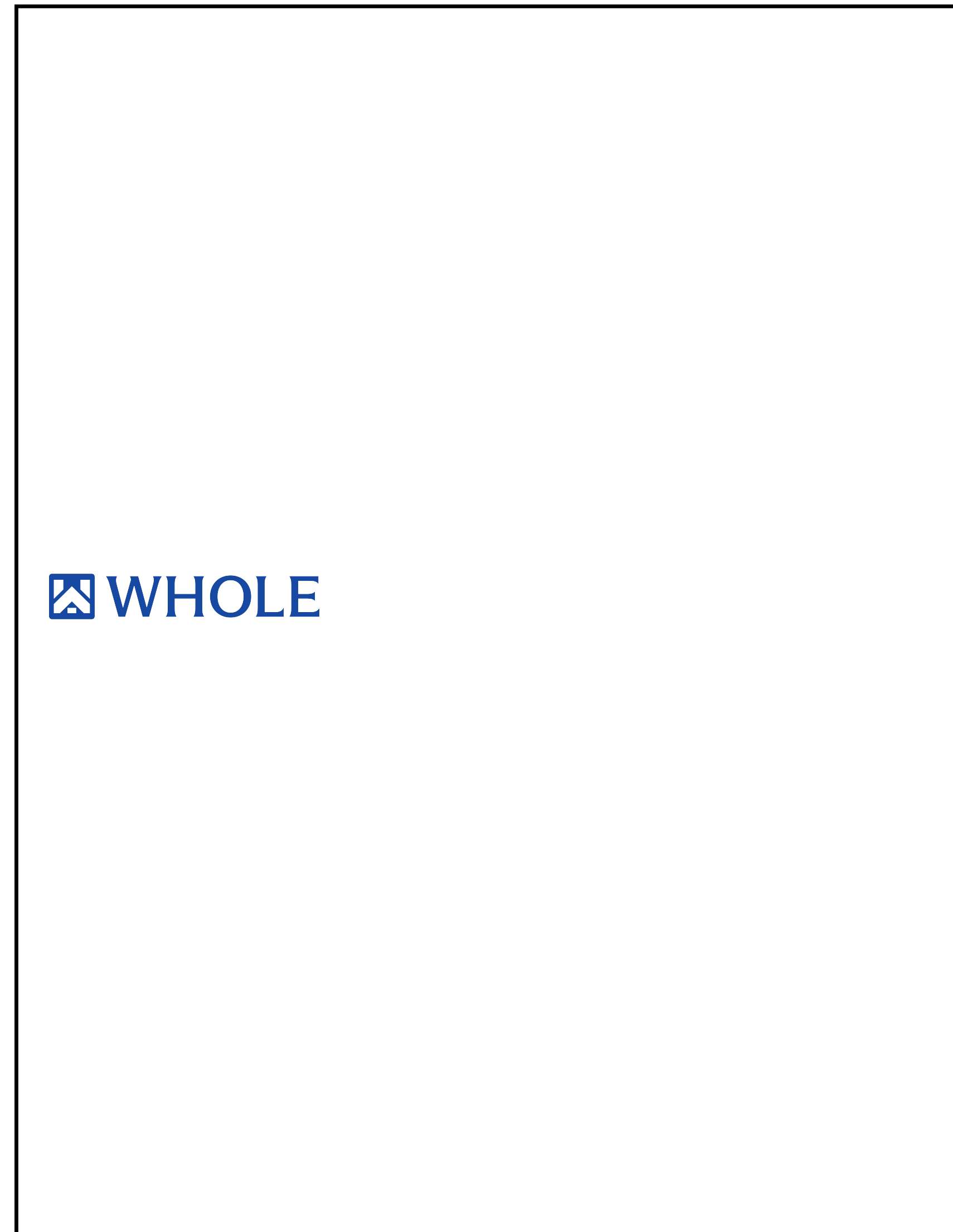
*Display / Functional Context